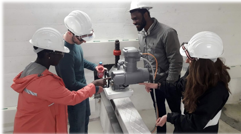
Water Distribution System